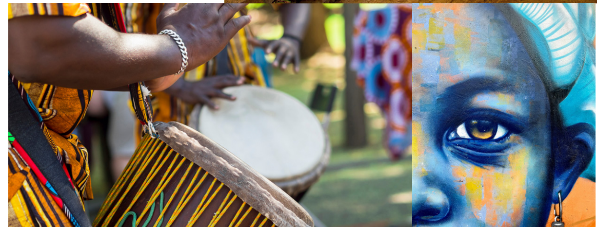
— Clockwise from top: Gorée Island; Local art; Street art Opposite page: Colorful boats