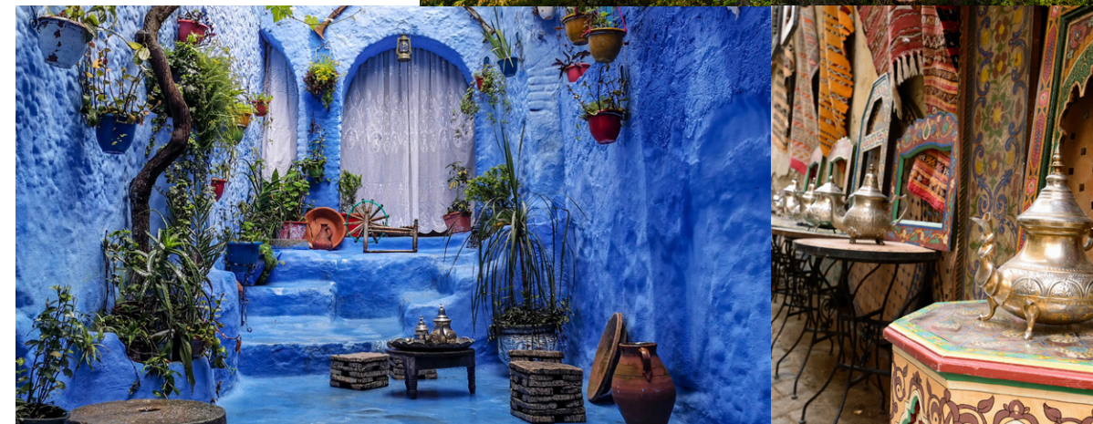
— Clockwise from top: Cap Spartel; Local market; Charming streets Opposite page: Blue buildings of Chefchaouen