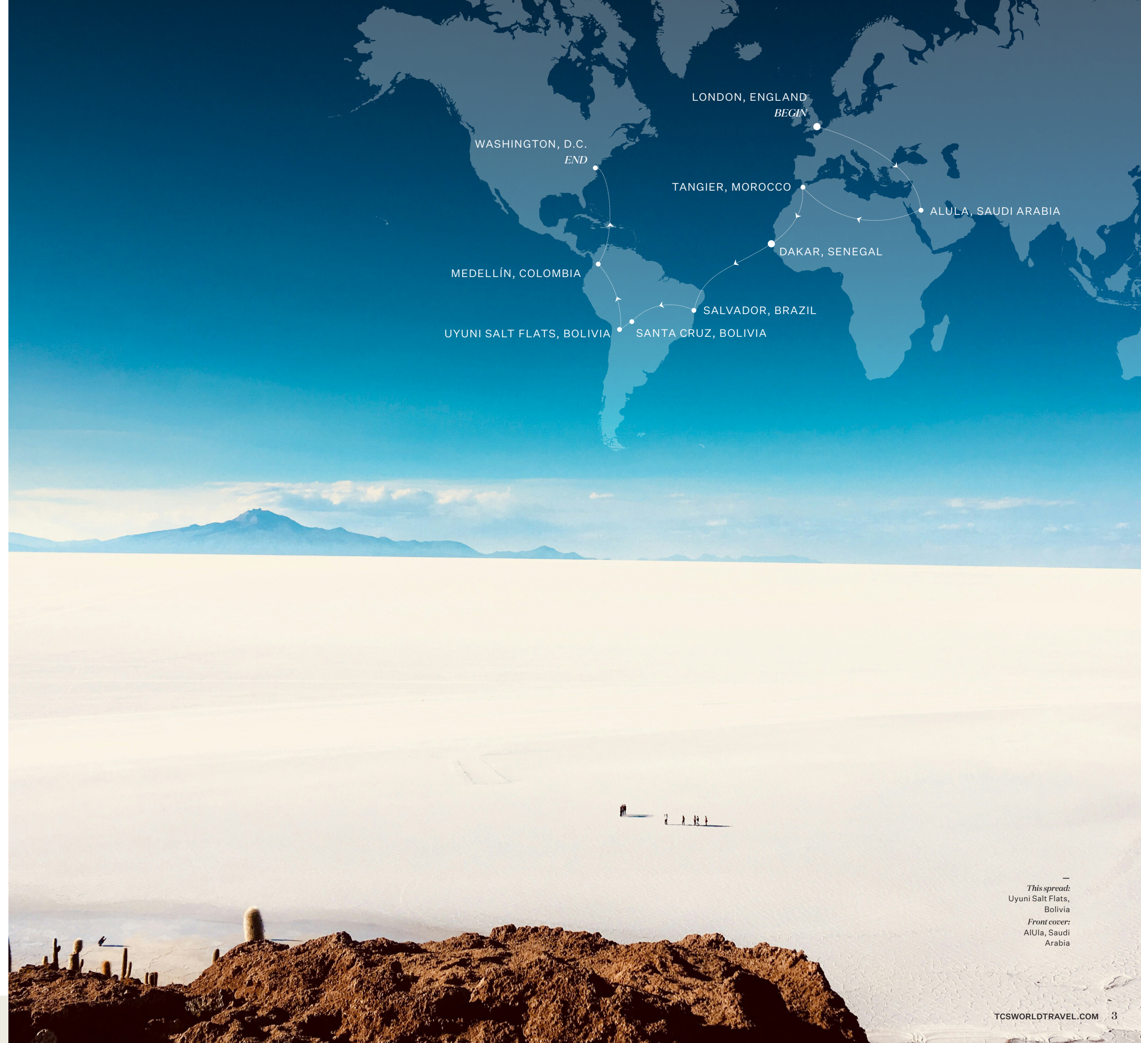
This spread: Uyuni Salt Flats, Bolivia Front cover: AlUla, Saudi Arabia