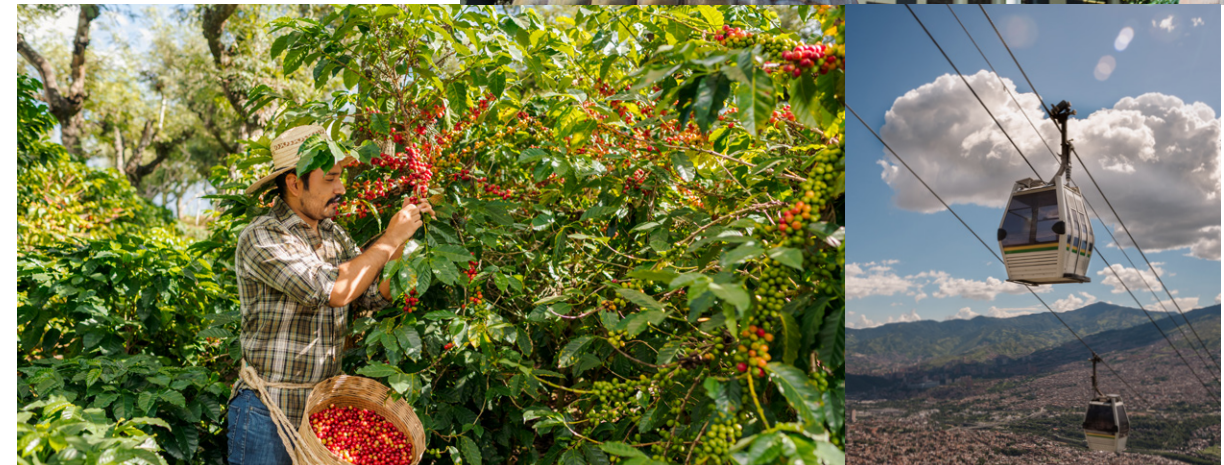
Clockwise from top: Fernando Botero sculpture; Metrocable commute; Coffee farming Opposite page: Plaza Botero