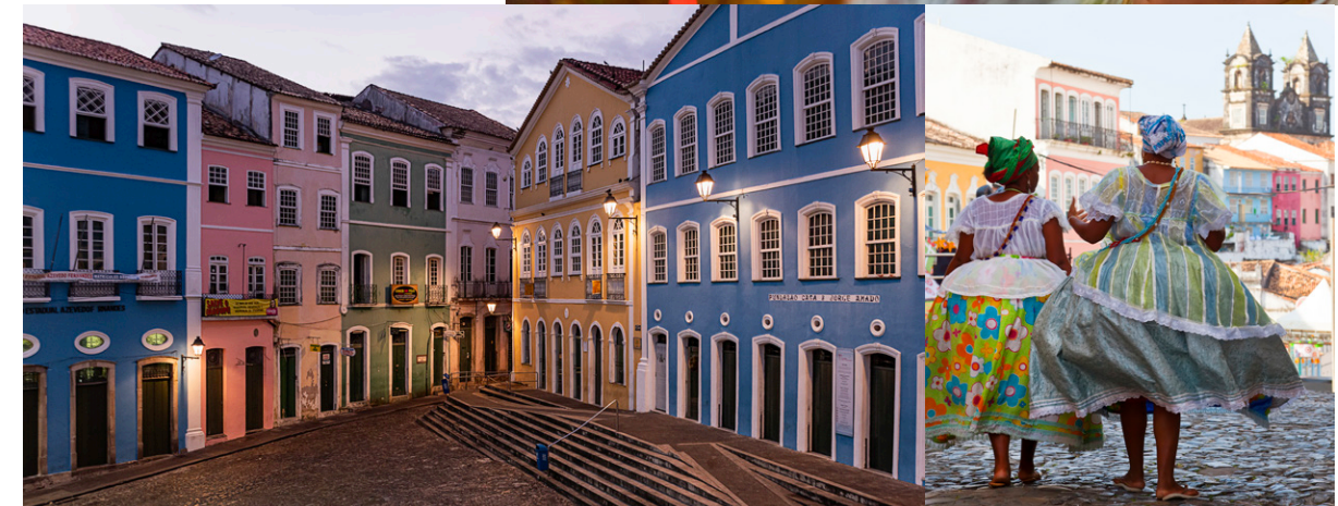
Clockwise from top: Carnival performance; Traditional outfits; Charming streets Opposite page: Pelourinho