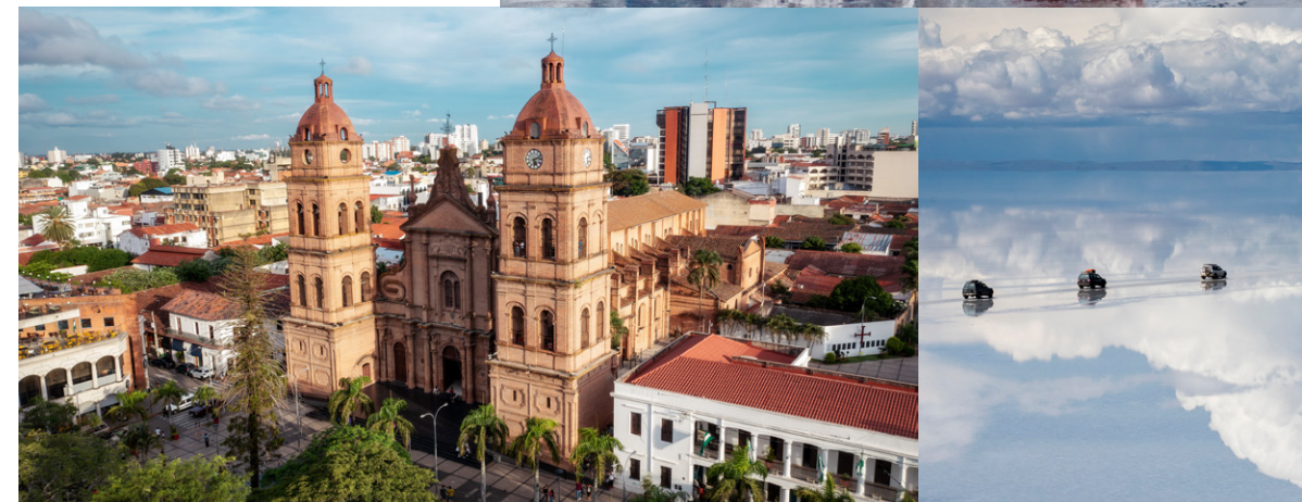
— Clockwise from top: Flamingos; The reflection of the salt flat; Santa Cruz, Bolivia Opposite page: Uyuni Salt Flats