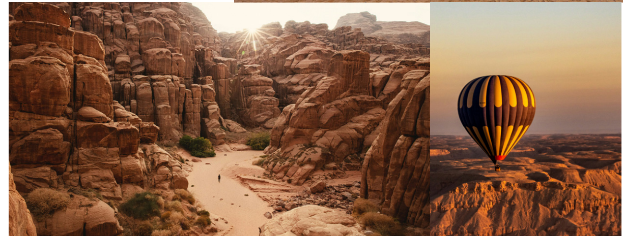
— Clockwise from top: Glass building of Maraya; Hot-air balloon over AlUla; Desert rock formations Opposite page: Sandstone tomb in Hegra